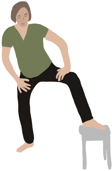
UPRIGHT PELVIS OPEN