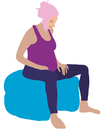
BIRTHING SEAT/SITTING BACKWARDS ON TOILET