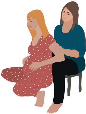
SEATED SPPORTED SQUAT